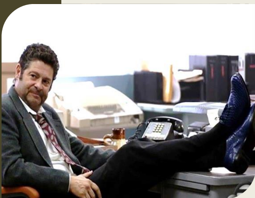
WICKED CITY (ABC Studios)